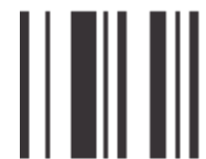
1 bit B&W Bitmap

The CDU Committee meets 1st Tuesday of each month. 7pm until 9.30pm - 8 Pamela Place, Ringwood North, 3135